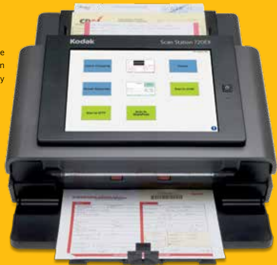
Large touchscreen display