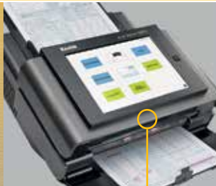
Improved paper handling