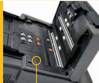
Robust build quality

STREAMLINED PROCESSES IMPROVED COMMUNICATION INCREASED PRODUCTIVITY